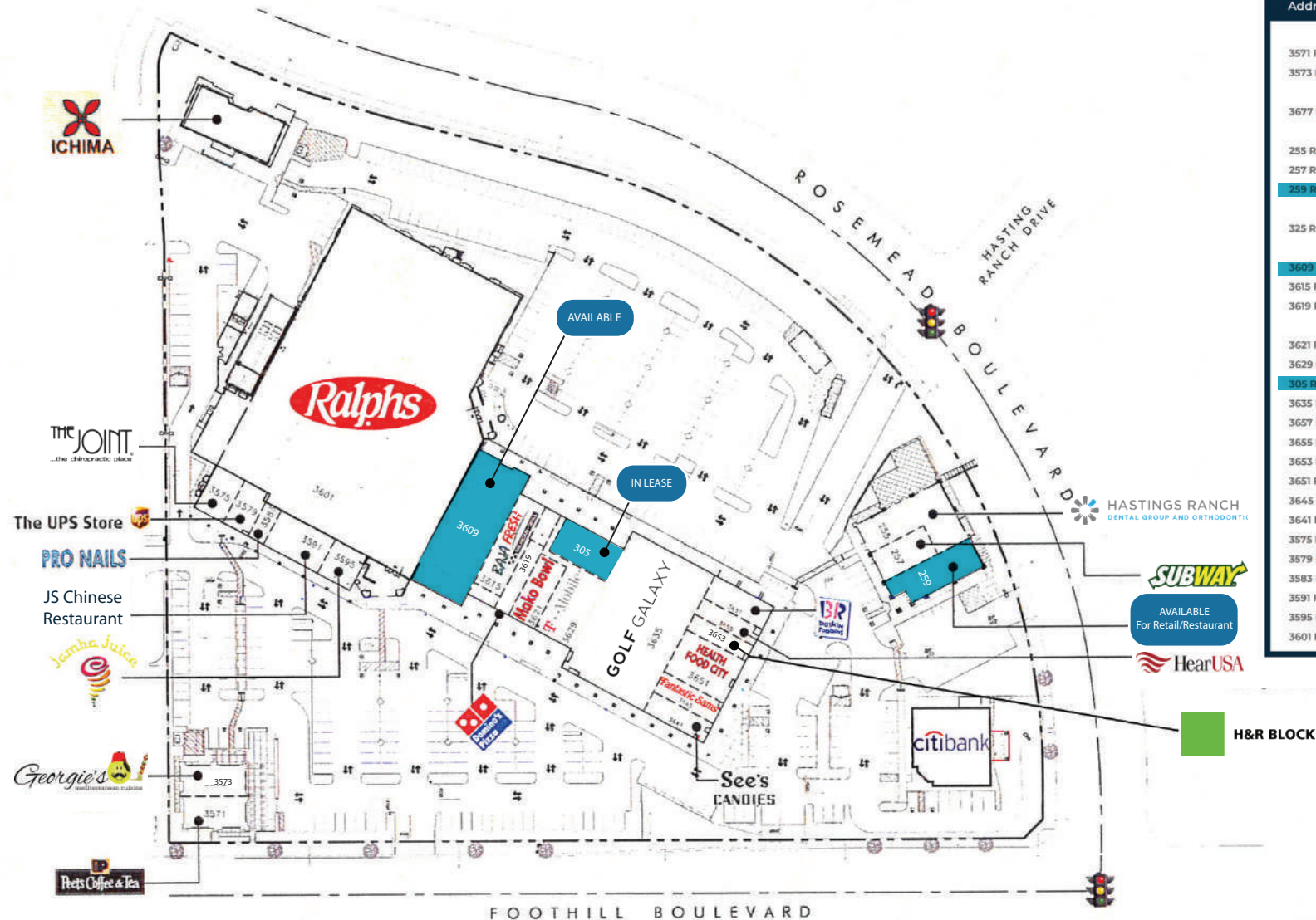
Foothill / Rosemead Marketplace Existing Area Calculations