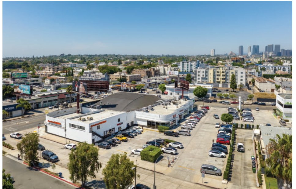
View of Center